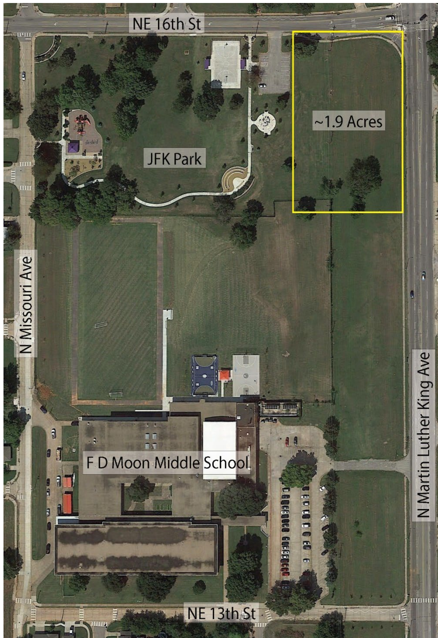
Exhibit 1: Property offered by OCURA

The OKLAHOMA CITY URBAN RENEWAL AUTHORITY (“OCURA”) invites the presentation of written proposals from qualified developers (“Redeveloper”) for the purchase and redevelopment of an approximately 1.9-acre tract of land, depicted on Exhibit 1 below: