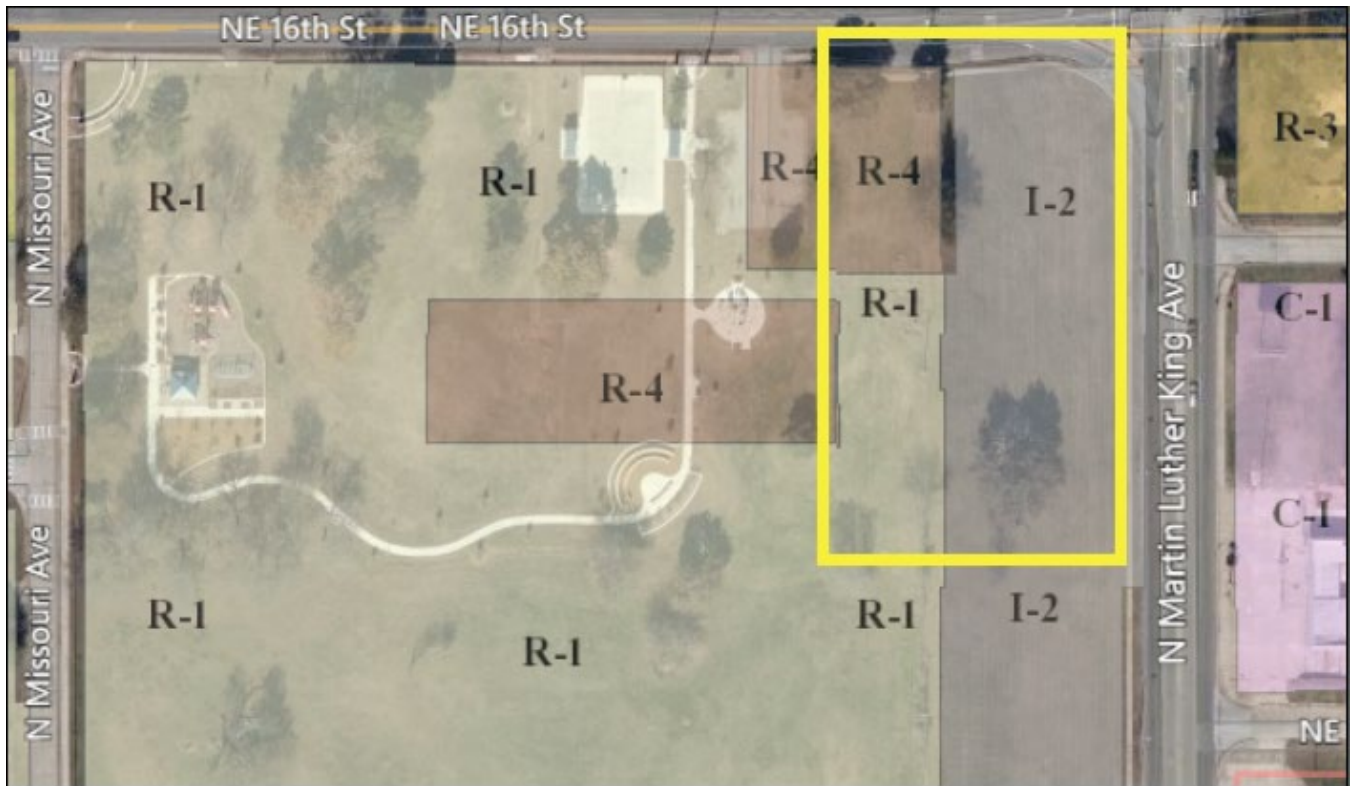
Exhibit 4: The City of Oklahoma City Zoning Requirements

Proposals submitted must be conceptually consistent with all current policy and regulatory documents with the exception that the site may need to be rezoned to accommodate a redevelopment proposal. In addition to the requirements of the City, it is the goal of OCURA to require high-quality development standards and design principles to lead as an example for future development. OCURA recognizes that rezoning to a planned unit development may be necessary and would support that action if agreed to as part of a Redevelopment Agreement.