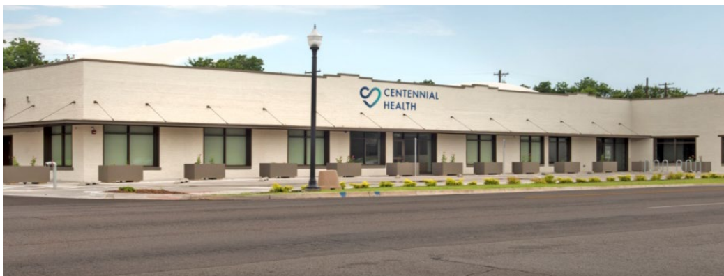
Exhibit 3: Centennial Health at 1720 NE 23 rd Street

Approximately three-quarters of a mile northwest, located at NE 23 rd and Rhode Island Avenue is a new retail center known as EastPoint by local developers, Pivot Project. Pivot Project has rehabilitated a former row of buildings along NE 23 rd Street. The project contains approximately 41,000 square feet of office and retail space. The buildings are home to Centennial Health , an optometrist, office buildings, restaurants, a coffee shop, as well as the recently opened Market at EastPoint . This is the first major development that has happened in the area in years. The development is a catalyst project.